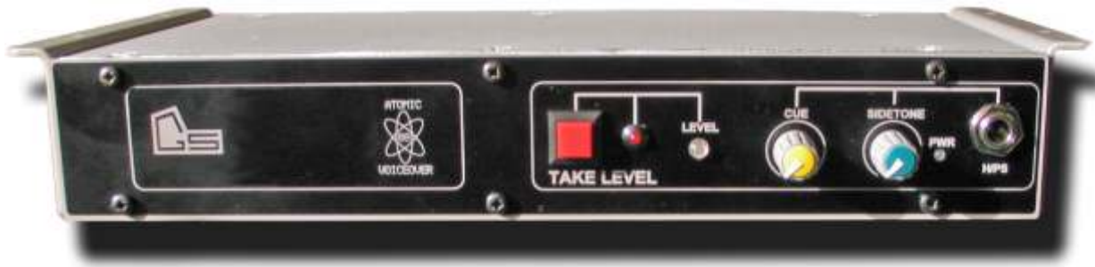
Voiceover 08 Voiceover artists interface