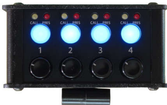
Beatrice B4+ Front