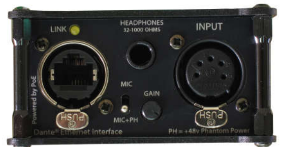
Beatrice B4+ Rear (pictured with optional 5 pin headset connector)