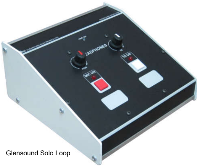
GlenSound Solo Loop