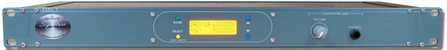
DAC 1 Front