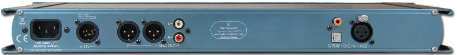
DAC 1 Rear